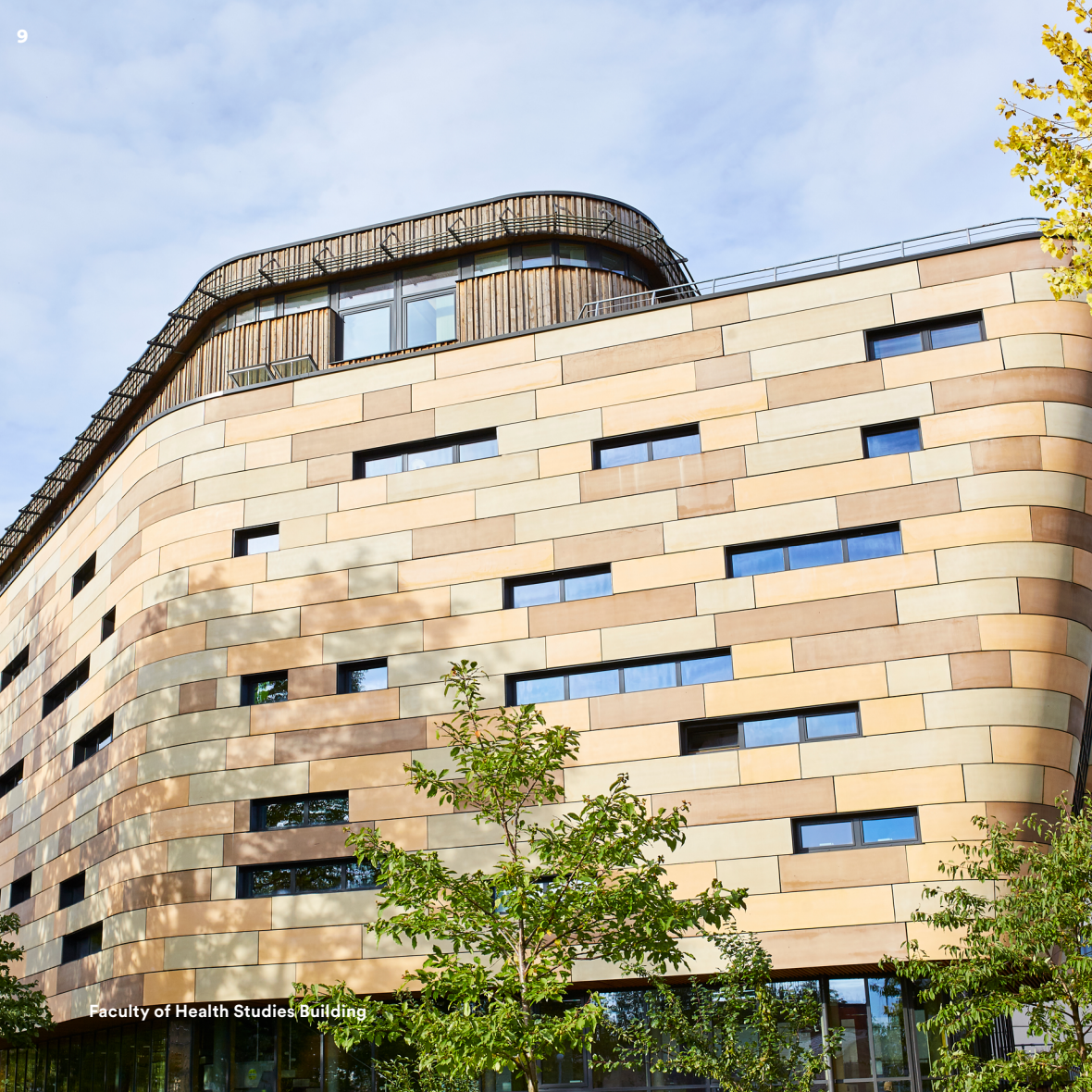
Faculty of Health Studies Building