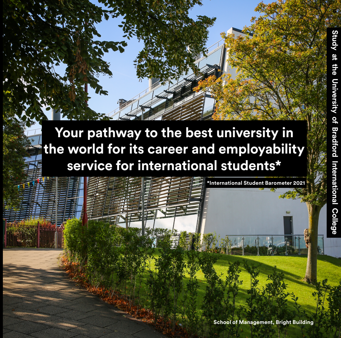
School of Management, Bright Building