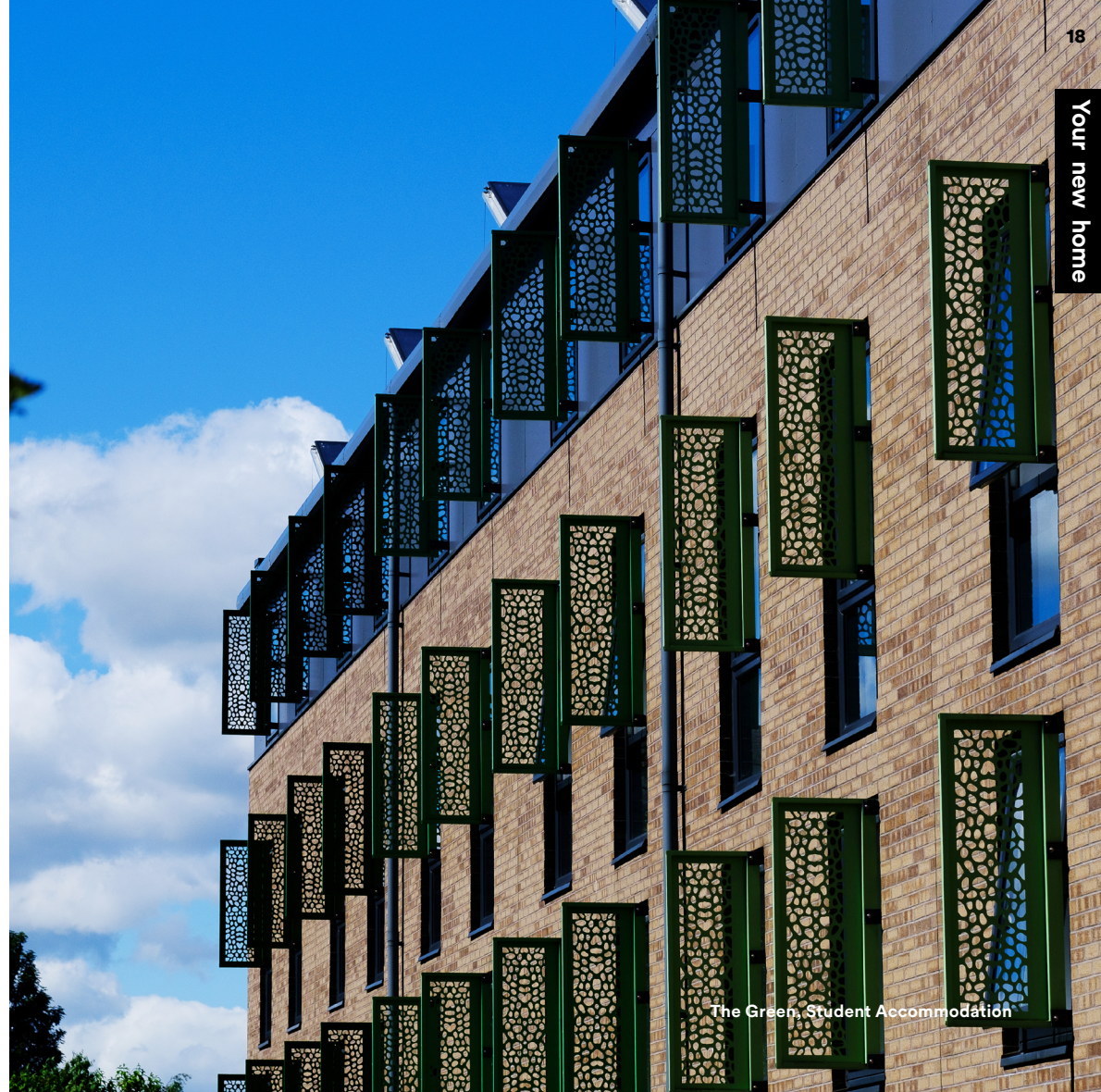
The Green Student Accommodation

bradford.ac.uk/student-life/living-costs