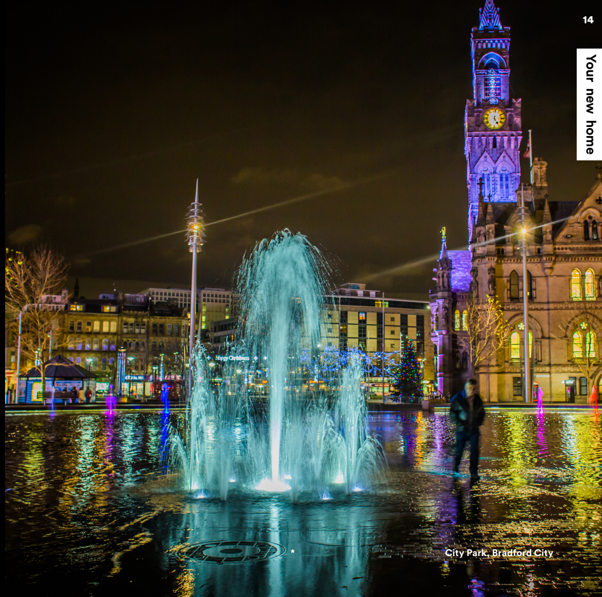
City Park, Bradford City