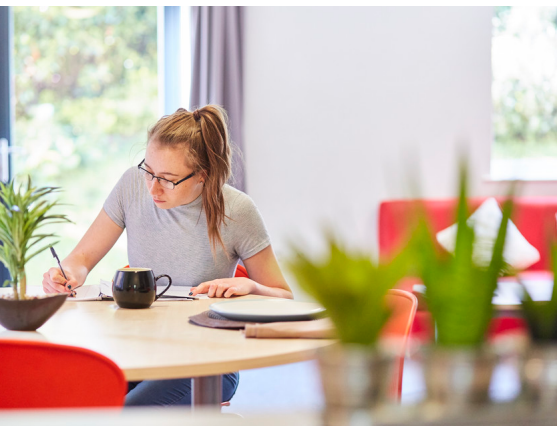
The Green Student Accommodation

The Green is the accommodation recommended by the University of Bradford. It is easily accessible from university spaces such as the Students' Union and the library. It is also a short walk away from the city centre and local attractions.