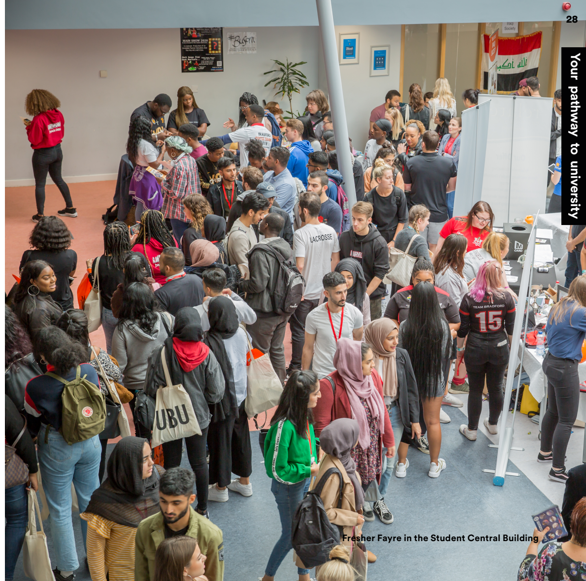
Fresher Fayre in the Student Central Building