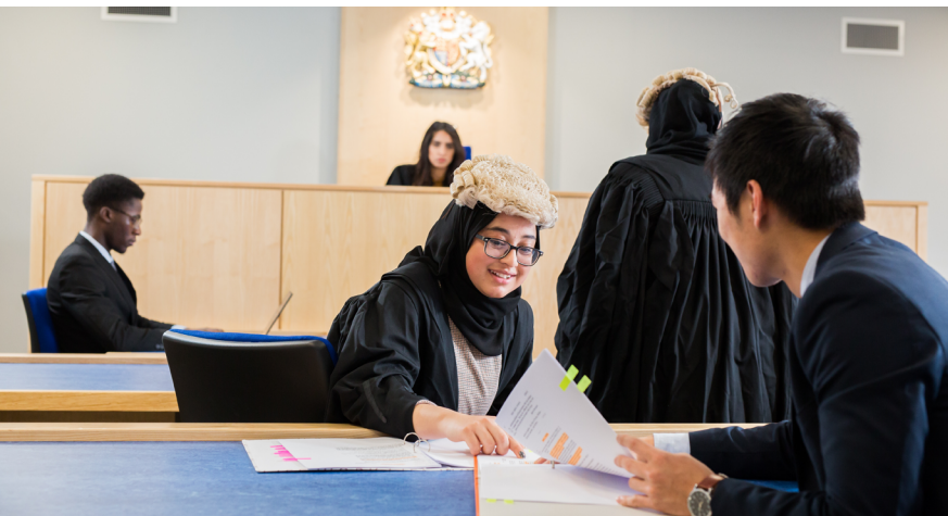
Law Students in the Mock Court

When applying to University of Bradford International College, you will need to select your desired degree course. You can find our range of pathway programmes and continuation degrees at the University of Bradford on pages 24-27.